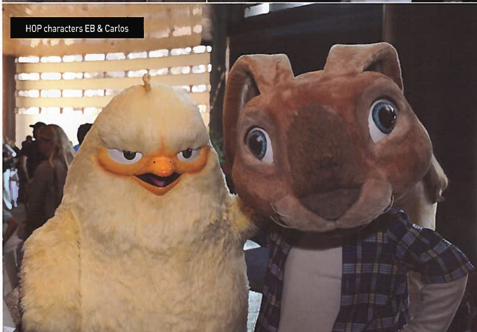
HOP characters EB & Carlos