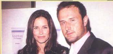
Courteney Cox Arquette and David Arquette at the EB Medical Research Fundraiser.