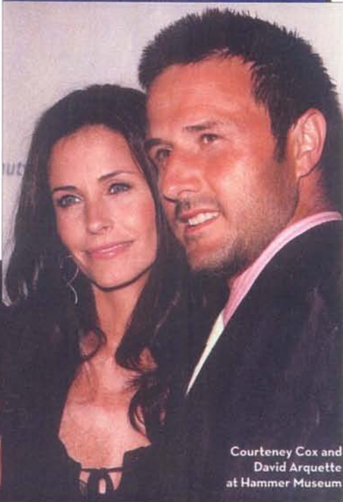
Courteney Cox and David Arquette at Hammer Museum

"I shower every day with 25 guys, some prettier than others."