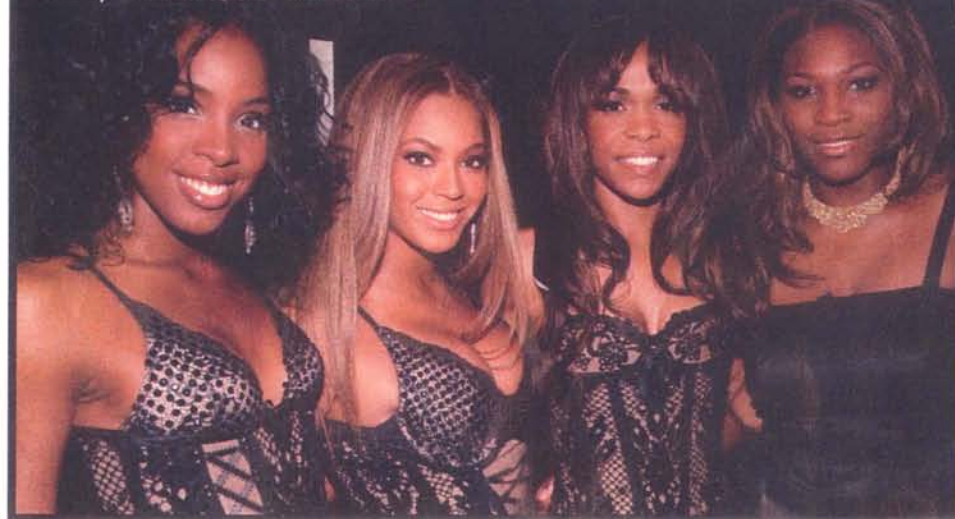
Destiny's Child and Serena Williams at ESPYs

—Red Sox pitcher CURT SCHILLING at ESPYs