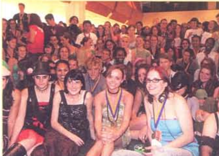
Christina Ricci with students at the CSSSA Honors.

Courteney Cox and Kinerase host a fundraiser for the EB Medical Research Foundation. HAMMER MUSEUM, LOS ANGELES JULY 11, 2005