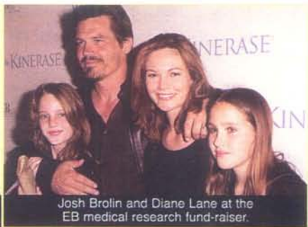
Josh Brolin and Diane Lane at the EB medical research fund-raiser.