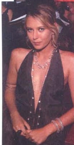
Maria Sharapova at ESPYs