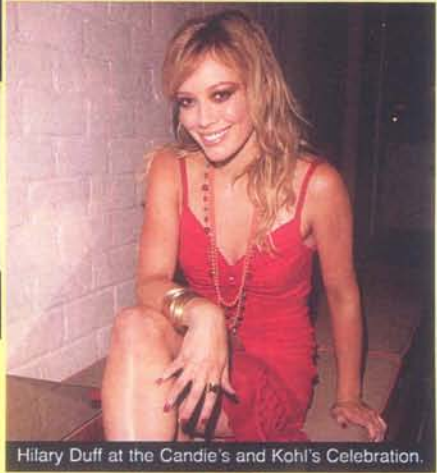
Hilary Duff at the Candie's and Kohl's Celebration.

The Monte Carlo Television Festival MONTE CARLO JUNE 30, 2005