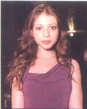
Michelle Trachtenberg at the Candie's and Kohl's celebration.