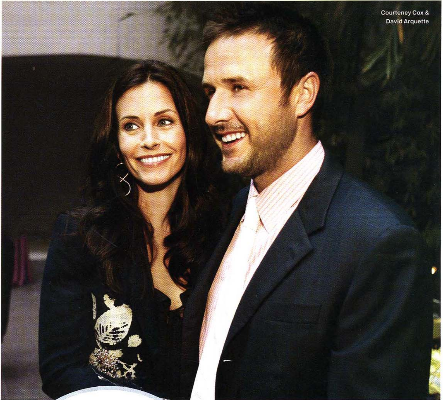
Courtney Cox & David Arquette