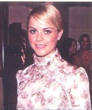
Taryn Manning at the Candie's and Kohl's celebration.