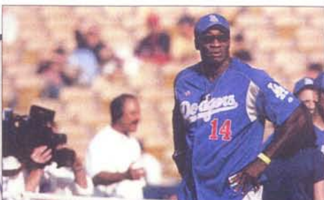
Michael Clarke Duncan at Hollywood Stars