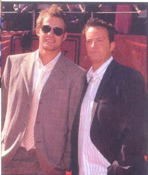
Andy Roddick and Matthew Perry at ESPYs