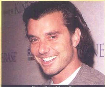
Gavin Rossdale at the EB medical research fund-raiser.